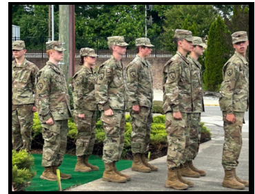
CORBIN HIGH SCHOOL JROTC

Flag Day, observed annually across the United States, was marked with a remarkable display of dedication and reverence by members of Elks Lodge #2826. Known for their commitment to charitable endeavors and community service, the Elks organized the event to highlight the significance of the American flag and to unveil an updated Corbin Elks Veterans Memorial community garden. Several Elks members contributed time and labor in landscaping the area, with a generous donor providing a new flag pole for the garden.