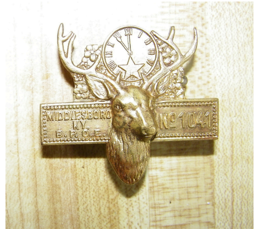
Lodge pin with #1041 from 1906-1912